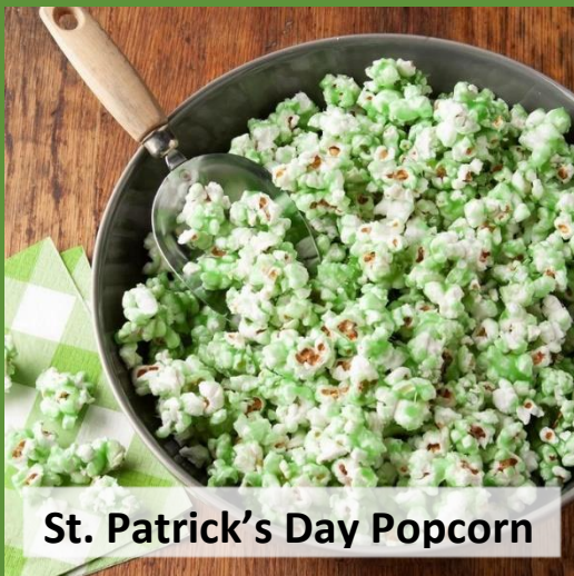
St. Patrick's Day Popcorn